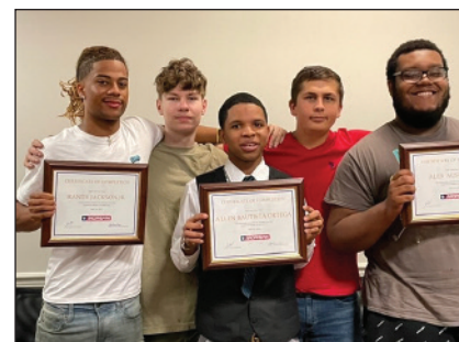
Spring 2022 High School Welding Internship Program Recognition Ceremony.

employment to start upon graduation as a full-time welder. The program consists of classroom training, hands-on training, and on-the-floor training.