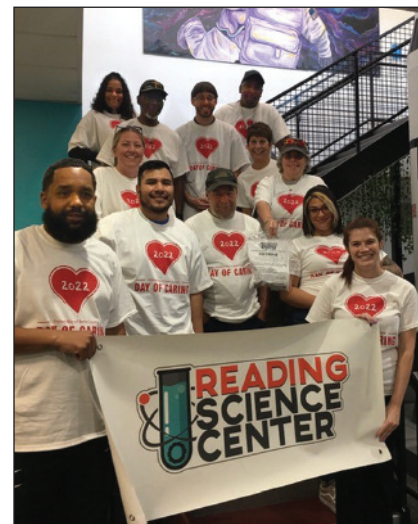
Morgan Truck Body team members participating in Day of Caring for the United Way.

Morgan Truck Body started their 2022 fall welding internship program September 6th. There are 8 local high school seniors participating from Coatesville Area Senior High School, Wilson High School, and Chester County Intermediate Unit Learning Center. The Welding Internship Training Program will certify school aged students to become entry level certified Morgan Welders. Students participating in the program may be offered regular