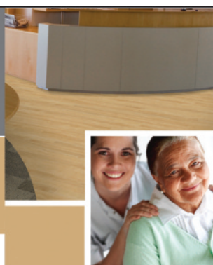
FLOORING SOLUTIONS MADE SIMPLE

www.chesmontcarpetone.com LIC# PA0081672