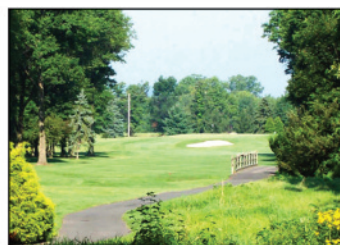
Pennsylvania's "BEST 36 Holes."

Pro Shop Hours Open seven days a week 6:00 AM - Dusk Weather Permitting