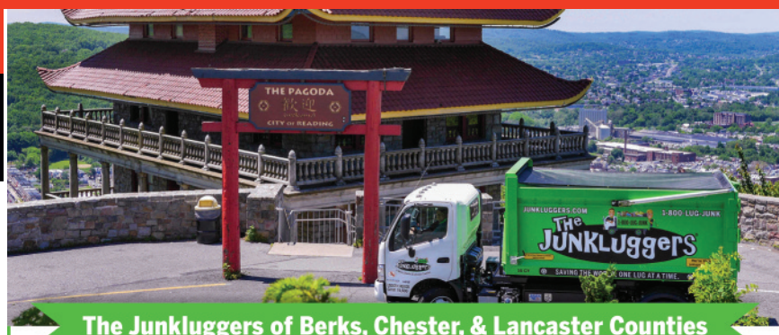
The Junkluggers of Berks, Chester, & Lancaster Counties