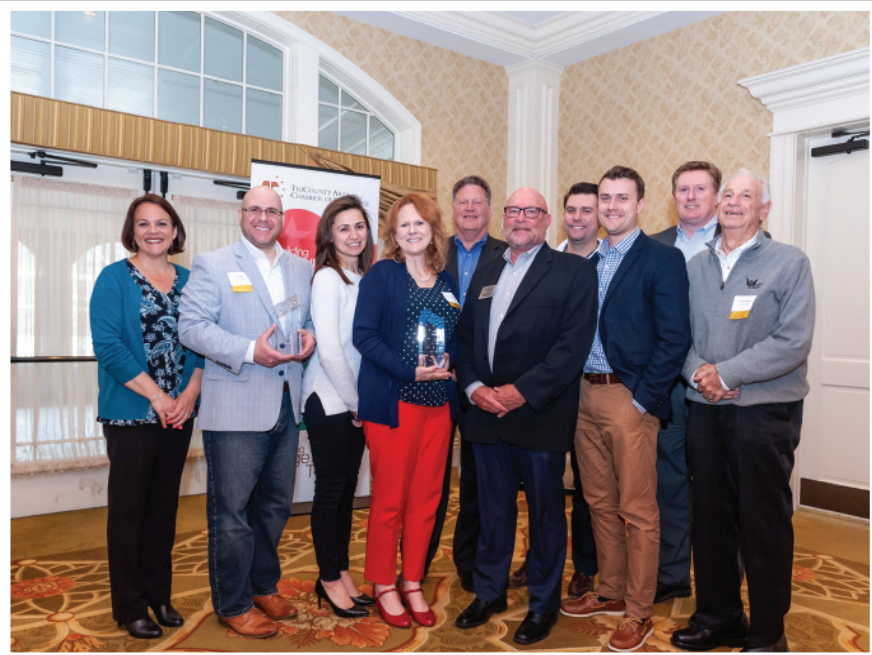
Chamber Champion: The Victory Bank