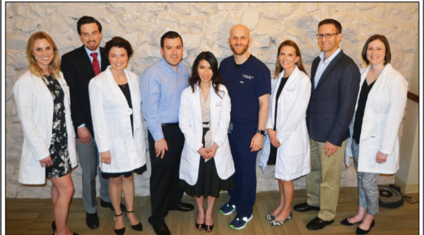
Board Certified Dermatologists

FOR ALL YOUR MEDICAL & SURGICAL DERMATOLOGY NEEDS