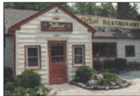
Filming Site for The Happening