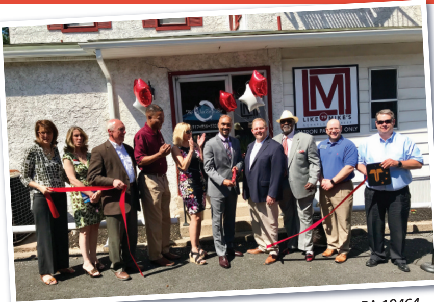
Like Mike's , 79 North Charlotte Street, Pottstown, PA 19464