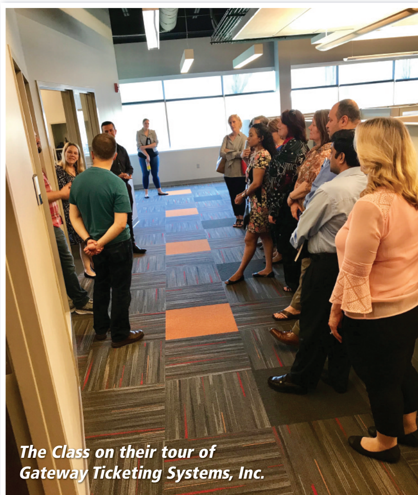
The Class on their tour of Gateway Ticketing Systems, Inc.

The class ended their day by running through their presentations for June's Breakfast and giving each other feedback.