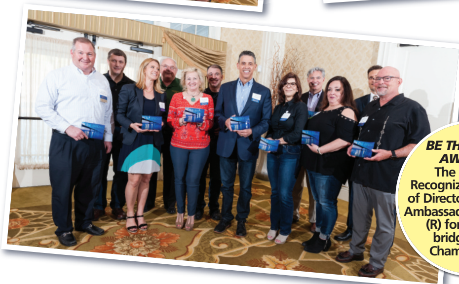
BE THE BRIDGE AWARDS – The Chamber Recognized the Board of Directors (L) and the Ambassador Committee (R) for being the bridge for the Chamber Staff!