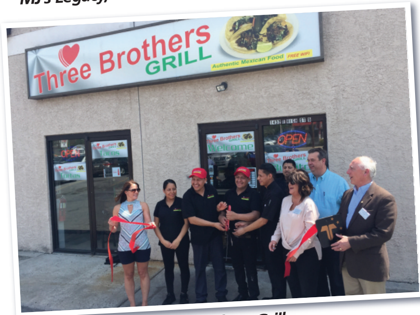
Three Brothers Grill , 1432 East High Street, Pottstown, PA 19464