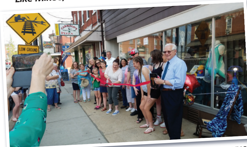
MJ's Legacy , 112 E. Philadelphia Avenue, Boyertown, PA 19512