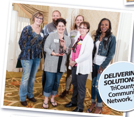
DELIVERING SOLUTIONS – TriCounty Community Network, Inc.