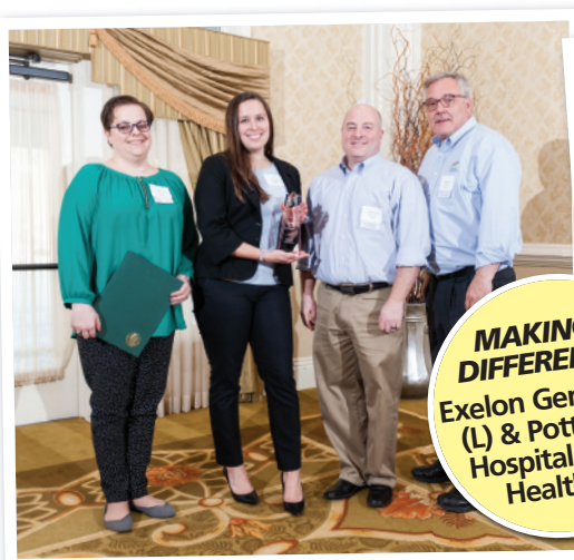
MAKING A DIFFERENCE – Exelon Generation (L) & Pottstown Hospital Tower Health (R)

The Chamber presented new awards this year, and we congratulate the winners: