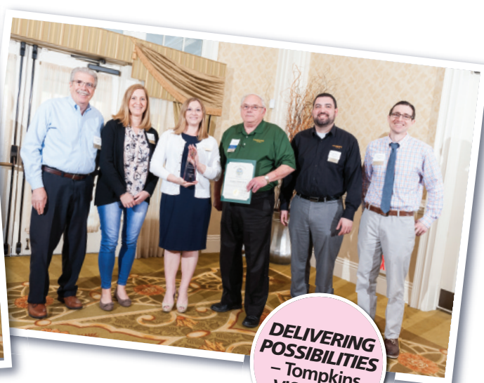
DELIVERING POSSIBILITIES – Tompkins VIST Bank