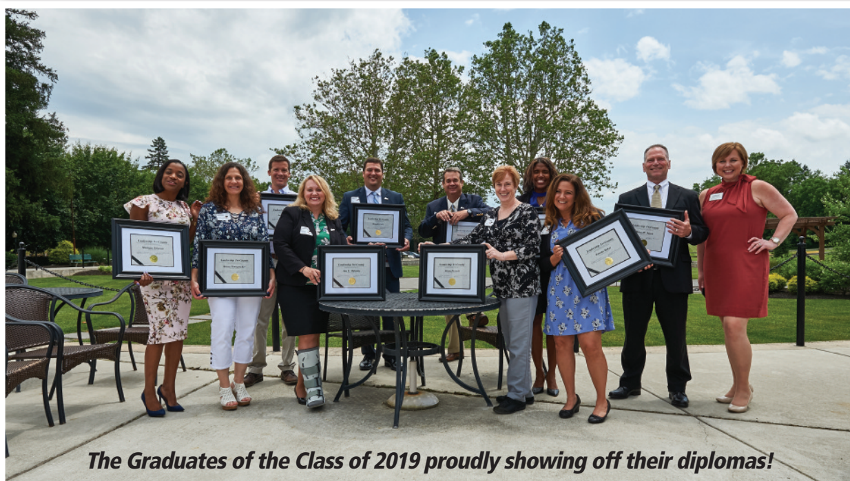
The Graduates of the Class of 2019 proudly showing off their diplomas!