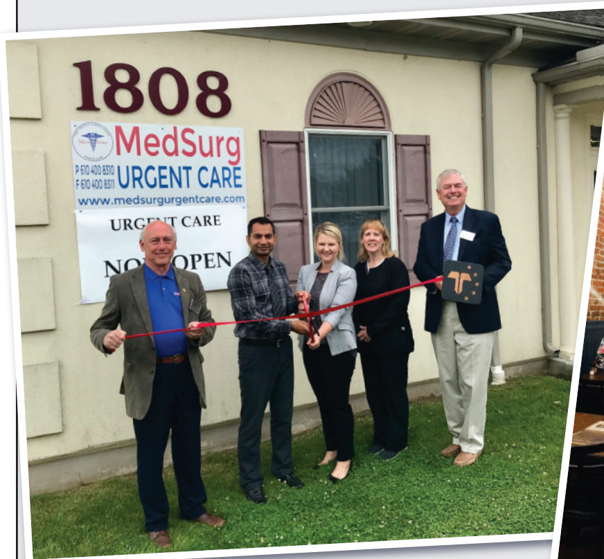
MedSurg Urgent Care, 1808 Swamp Pike, Suite 200, Gilbertsville, PA 19525

Pottstown PUB, 251 East High Street, Pottstown, PA 19464