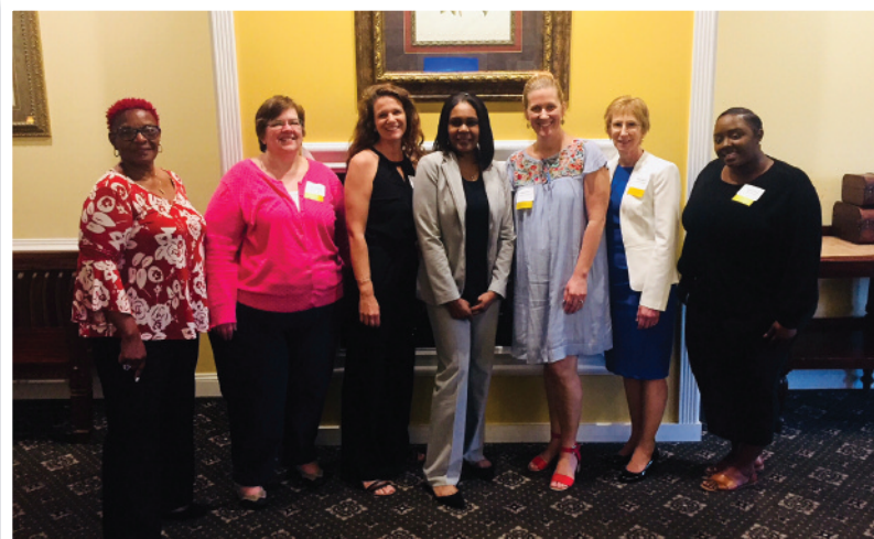
YWCA Tri-County Area

The Chamber was also happy to partner with TriCounty Community Network to present TCN's 3rd Annual Women's Symposium Awards. Congratulations to the winners in the following categories: