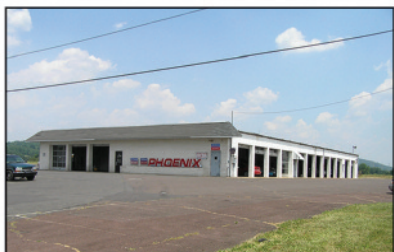
MIXED USE ZONING – BROAD USE POSSIBILITIES

Join the thriving Main Street Hellertown business community. This 8,000 SF building features 1,600 SF of fully renovated retail space, 4,000 SF of storage and a 3 bedroom 2 bath apartment. $575,000. Call Ed Brooks