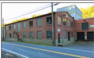
BOYERTOWN INDUSTRIAL BUILDING

Investment Opportunity for this multi-tenant industrial building in Boyertown. 26,000 SF two story brick and block building with base rent of $63,039. Tenants pay "nets." Building underwent renovations in 2017. $695,000. Call Ed Brooks