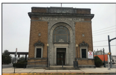
PREMIER LOCATION – UNLIMITED POSSIBILITIES

Route 29 near Route 100. Two buildings. Former 10,000 SF showroom - leased at $4,000 per month. 11,000 SF former service building lends itself to almost any commercial or industrial use. 4+ acres zoned Mixed Use. $990,000. Call Stan or Steve Rothenberger