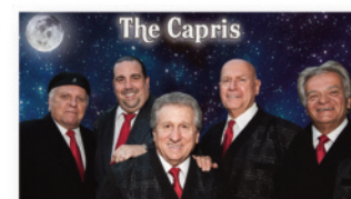
THE CAPRIS "THERE'S A MOON OUT TONIGHT, MORSE CODE LOVE"

DAVENPORT PERFORMING ARTS CENTER - POTTSTOWN SENIOR HIGH SCHOOL - 750 NORTH WASHINGTON STREET POTTSTOWN, PA 19464 RESERVED - $55.00 GENERAL ADMISSION - $45.00