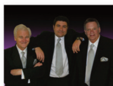
THE VOGUES "YOU'RE THE ONE" "MY SPECIAL ANGEL" "FIVE O'CLOCK WORLD"