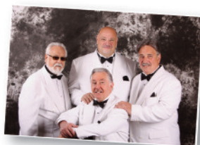
THE FIREFLIES "YOU WERE MINE"