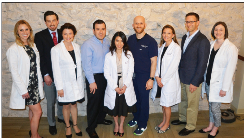
Board Certified Dermatologists

FOR ALL YOUR MEDICAL & SURGICAL DERMATOLOGY NEEDS