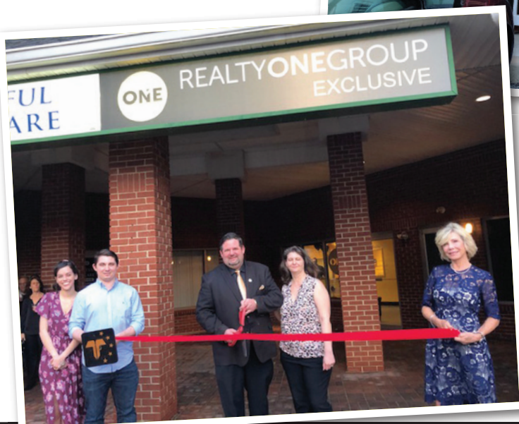
Realty One Group Exclusive, 1885 Swamp Pike, Suite 109, Gilbertsville, PA 19525