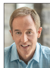
Andy Stanley, Leadership Author and Communicator