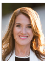
Dr. Caroline Leaf, Communication Pathologist and Cognitive Neuroscientist