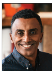
Marcus Samuelsson, Award-Winning Chef, Restaurateur, Author and TV Personality