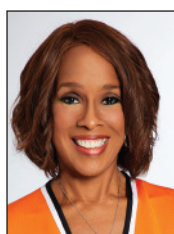
Gayle King, Co-host, CBS This Morning, Editor-at-Large, O, the Oprah Magazine