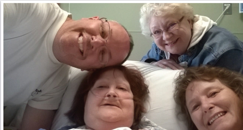
Post-op visit with family and friends, 2015