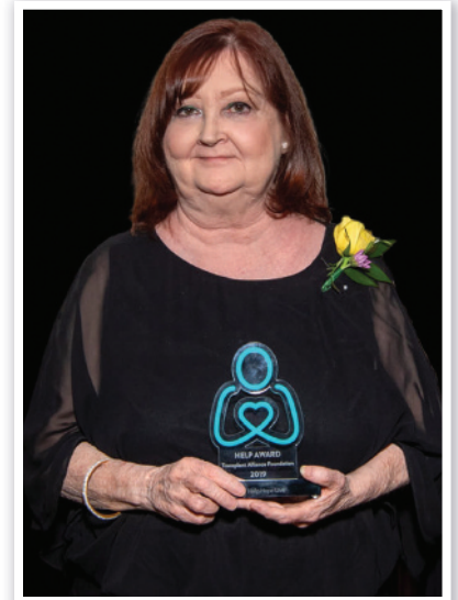
In 2019, the foundation was honored with the Help Award for work and donations to those in need.