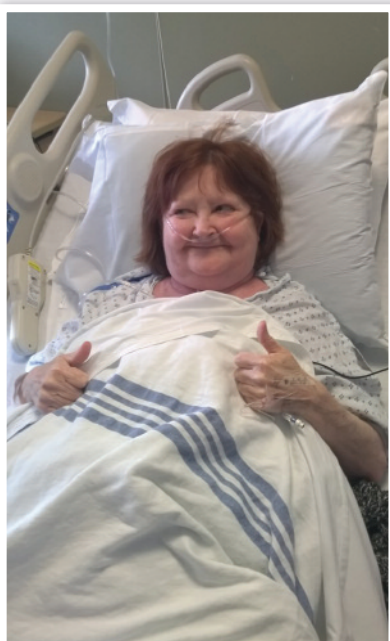
Second transplant, June 4, 2015