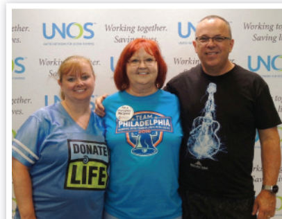
Transplant Games of America 2016, Ohio