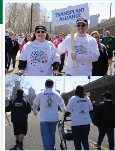
Gift of Life Donor Dash 2012, Philadelphia

To learn more about the Transplant Alliance Foundation, support its mission, or apply for assistance, visit TransplantAlliance.org . To attend upcoming fundraising events and bingo nights, visit TransplantAllianceBingo.com .