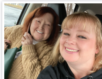
Running errands, 2019