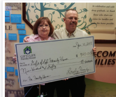
Our first donation to Gift of Life, 2013