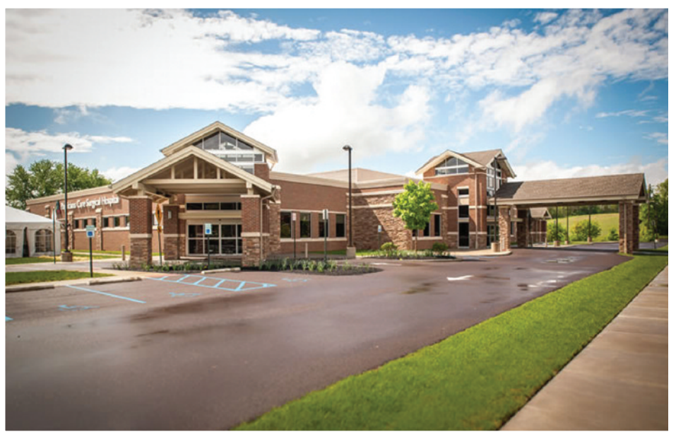
PCSH is located at 454 Enterprise Drive in Royersford and provides ample free parking.

P hysicians Care Surgical Hospital (PCSH) reflects both who we are and what we do. Founded by a dedicated group of local physicians, PCSH was created with a vision to deliver a better surgical experience for patients. Since opening our doors in October 2010, our mission has remained clear: to provide specialized surgical care in a high-quality, patient-focused environment that is both comforting and accommodating.