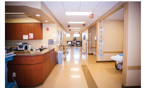
The central nursing station serves as the heart of our collaborative care model, supporting their award-winning staff.

Physicians Care Surgical Hospital is committed to elevating the quality of healthcare in our community. We actively advocate for our patients, operate with fiscal responsibility, and invest in initiatives that promote the well-being of both our patients and the broader community we serve.