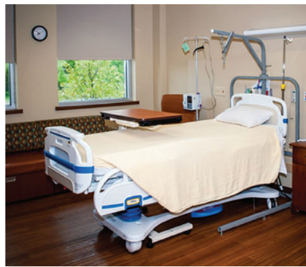
Featuring 12 private inpatient rooms designed for comfort and recovery.

Our mission is to serve every patient by understanding their unique needs and expectations. This patient-centered approach allows us to provide a safe high-quality environment for both surgery and recovery.