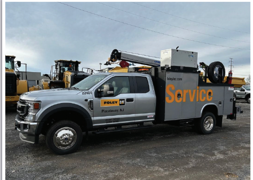
Service truck – Foley CAT