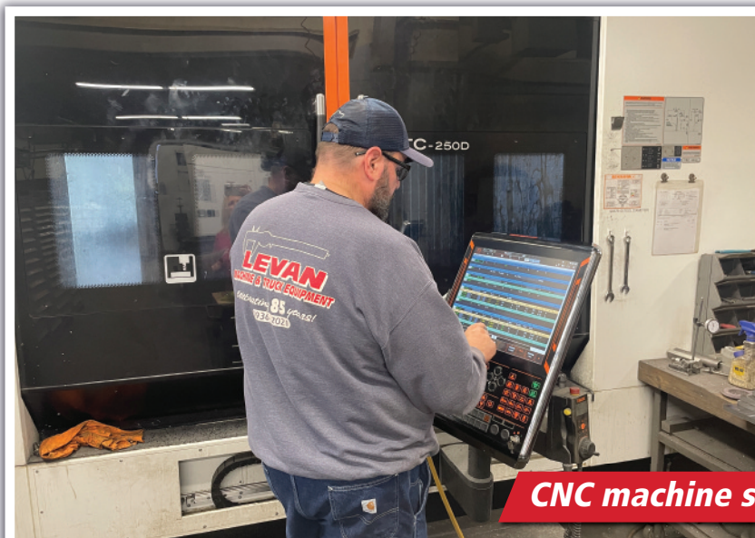
CNC machine shop