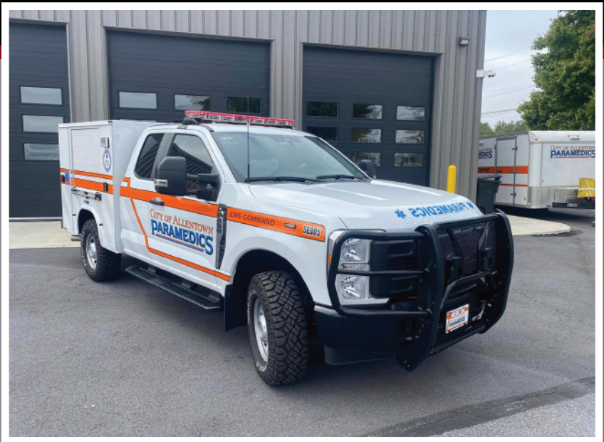
Custom EMS command truck – City of Allentown EMS