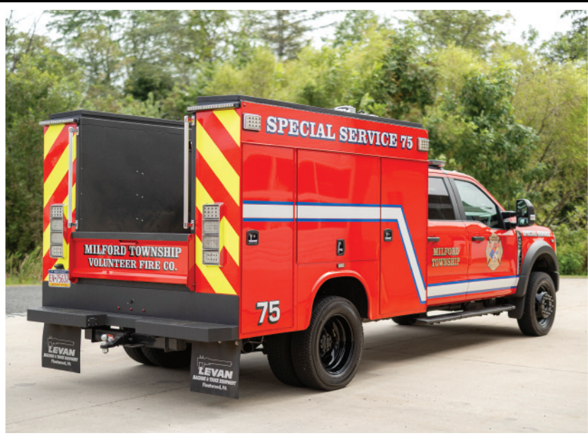
Rescue truck — Milford Township Volunteer Fire Company