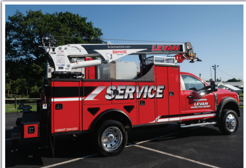
Levan is one of Knapheide Manufacturing's top 10 dealers in the U.S.