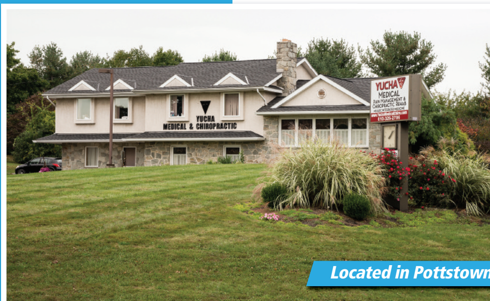
Located in Pottstown

When it comes to applying a “cutting-edge” approach to helping individuals achieve optimal health, physical rehabilitation and pain management, Yucha Medical Pain Management & Chiropractic Rehabilitation “wrote the book,” so to speak.