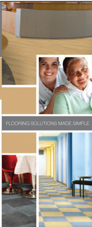
FLOORING SOLUTIONS MADE SIMPLE

www.ches-montcarpetoneparkerford.com LIC# PA0081672