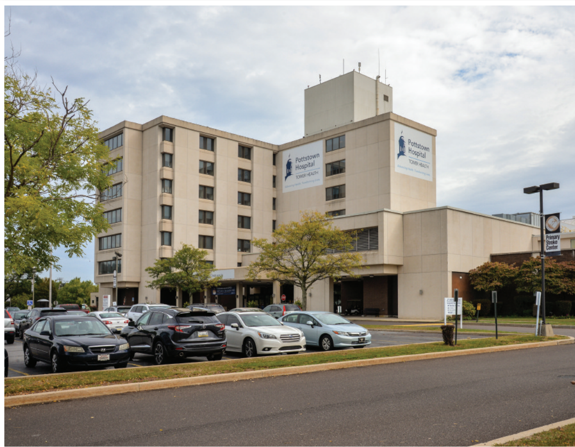
Pottstown Hospital – Tower Health located at 1600 E High St, Pottstown, PA 19464

Ever since Pottstown Hospital (formerly Pottstown Memorial Medical Center) became a part of the West Reading-based non-profit Tower Health in October 2017, a remarkable transformation has taken place. Within the first six weeks, the parking lots were re-paved – the beginning of nearly $6.5 million in infrastructure investments over the next 12 months, including new back-up generators, upgrades to the hospital’s HVAC and IT systems, and the addition of new technology.