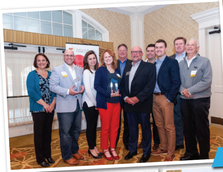
2019 ANNUAL DINNER