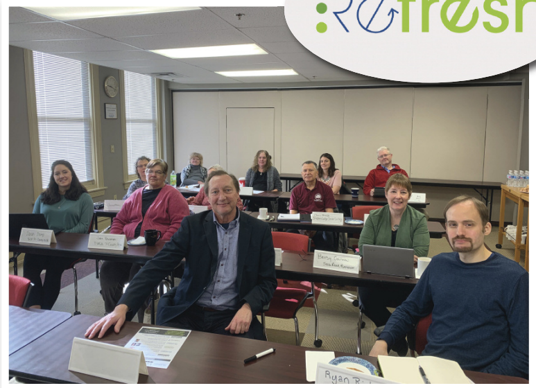
Thank you to everyone who attended!