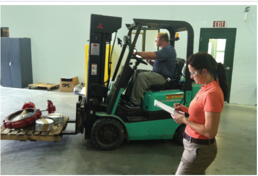
Forklift Operator License Evaluation

Please see our website ( www.advanced-safetyih.com ) to see the full list of topics we address. If you don't see what you need, please inquire.