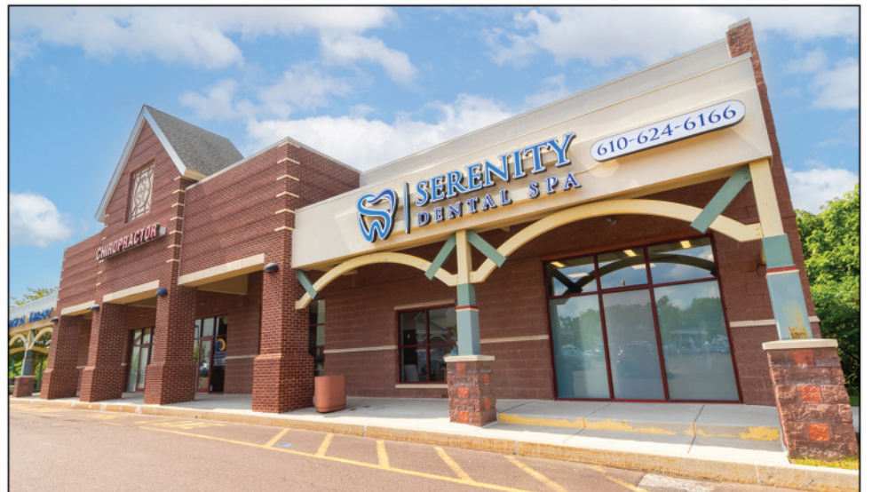
Located in the Suburbia Shopping Center, 4 Glocker Way, Pottstown, PA 19465