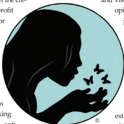
"Your Non-profit Angel"

For aspiring founders entering into establishing a new non-profit, Breadth of Hope offers an extensive suite of services. Guiding these visionaries through the