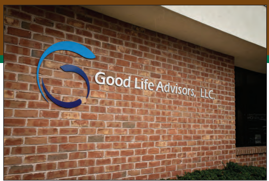
Good Life Financial Group at 30 Commerce Drive, Wyomissing.