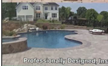
Professionally Designed, Installed & Warranted Hardscapes