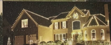
Professionally Installed Commercial & Residential Lighting