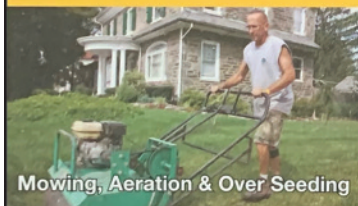
Mowing, Aeration & Over Seeding

Commercial & Residential Christmas Decorating Services Roof Lighting • Window Lighting • Daytime Decor Tree and Shrub Lighting • Takedown Service • Storage