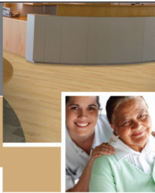
FLOORING SOLUTIONS MADE SIMPLE