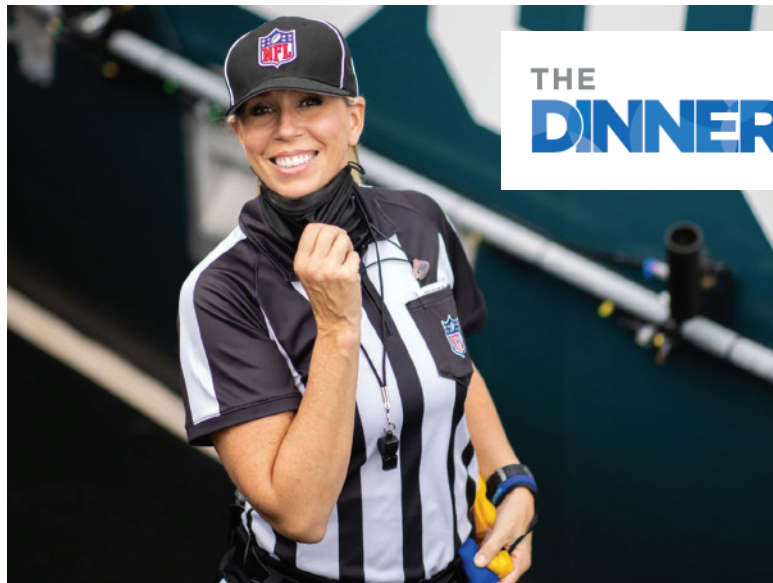
The NFL's first female referee, Sarah Thomas.