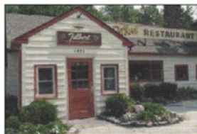
Filming Site for The Happening