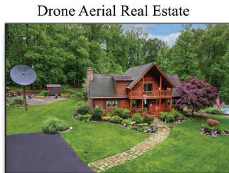
Certified FAA Drone Pilot

When you can have these: Business Headshots