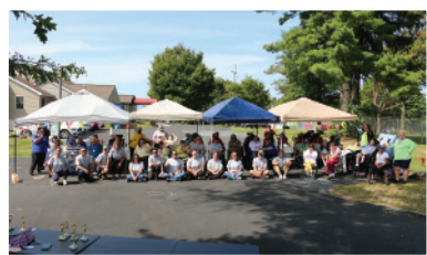
Constellation, formerly Exelon comes out each year and helps us with our special olympics.