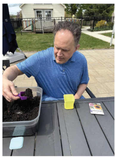
Clients planted seeds for Earth Day in April. Check out how they are growing!