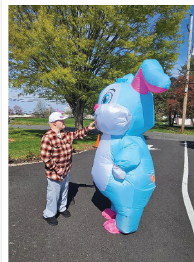
The Easter Bunny Came to Visit us.