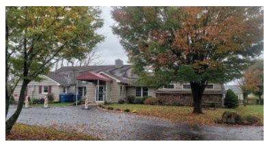
Located in Limerick.