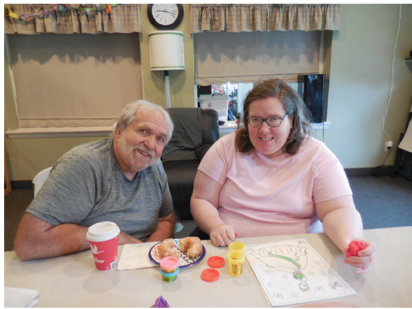
In June, we had a Father's Day "Donut and Coffee" get together for our clients and their father's.

Our structured program offers a variety of activities to meet the broad range of interests and abilities of our clients. Our professional staff assist individuals with activities, personal care such as incontinence care and dietary needs. Bon Homie also offers nursing services as well as Physical, Occupational and Speech therapies to those that qualify. Most importantly, everyone who attends our program experiences social interaction with the opportunity to form new friendships and to develop new interest by participating in the activities offered.