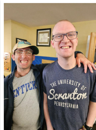
Friendships are Made.

There is funding available to attend our program if the individual qualifies. Please contact us for more information: 610.792.8800 or bonhomieadc@comcast.net.