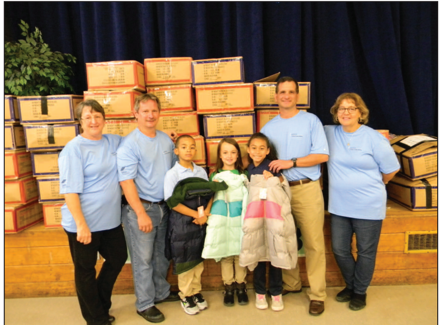
Limerick employees donating coats to Operation Warm through ACLAMO.