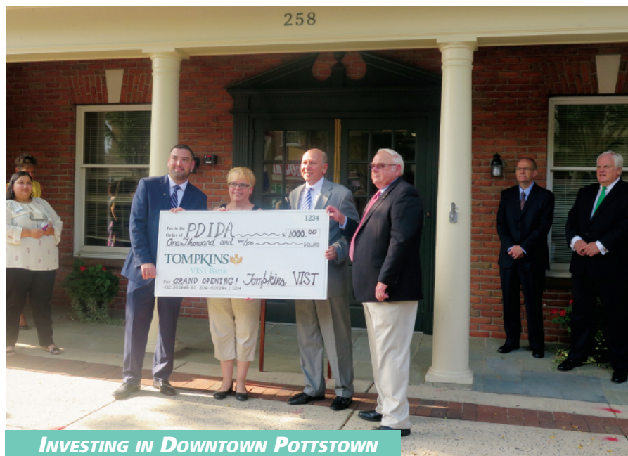
INVESTING IN DOWNTOWN POTTSTOWN