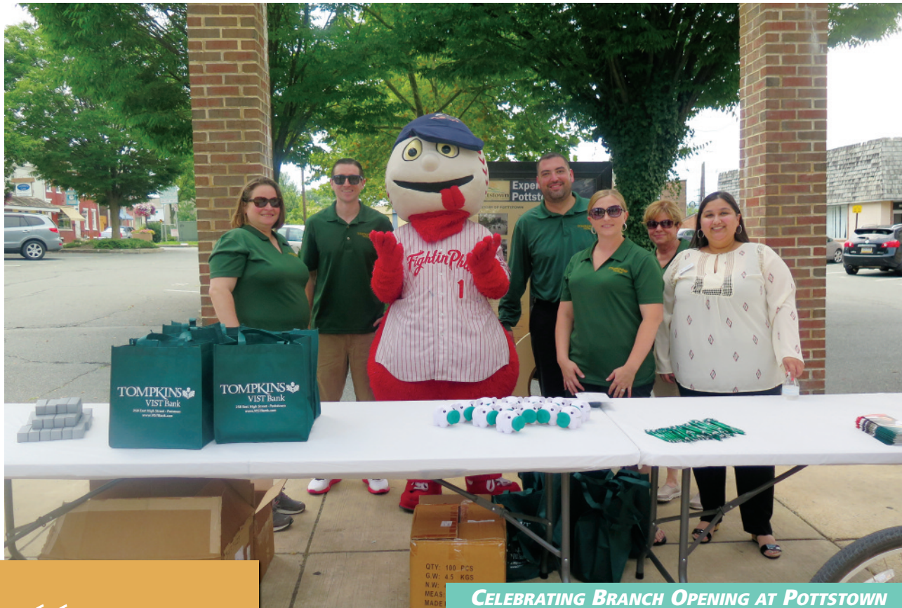
CELEBRATING BRANCH OPENING AT POTTSTOWN

Screwball from the Fightin' Phils joins staff of Tompkins VIST Bank at the grand opening celebration in Pottstown. The branch is shared with the bank's affiliate, Tompkins Insurance, and is located at 258 East High St.